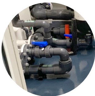
Grey UPVC sch 80 pipe work, valves & fittings