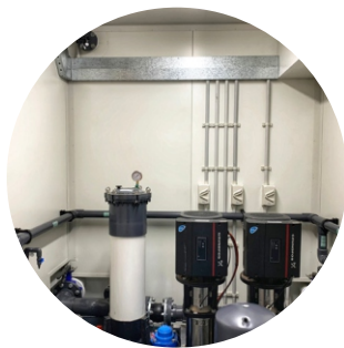
Premium quality Grundfos (or equivalent) pumps