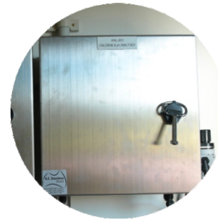
Vacuum chemical injection delivery system with Burkert Viton control solenoid