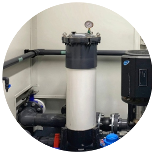
Stainless bag filter (315L)