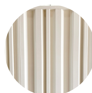
Potable water certified paint coating