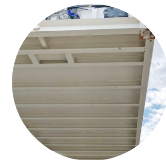
Forklift pockets for seamless plant relocation