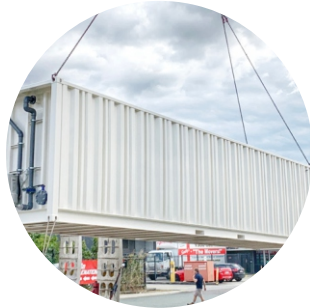
ISO Shipping Container design allows seamless transportability