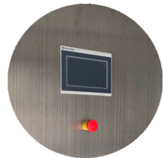
Fully automated control with Allen Bradley HMI & PLC