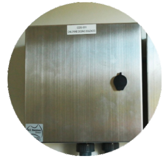
Robust and reliable Burkert pH & chlorine analysing cells