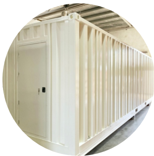
Robust steel construction to exceed Australian standards and harsh environmental conditions